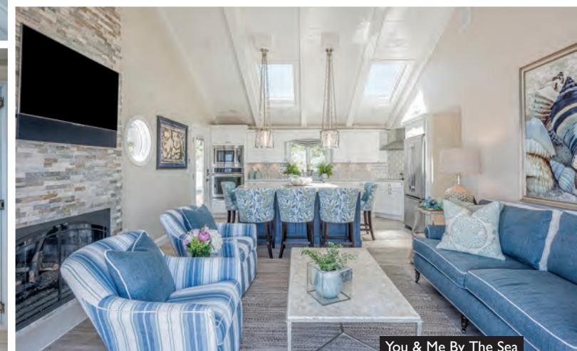
You & Me By The Sea

CASABELLA INTERIORS has extensive experience in guiding clients through the design stages of incorporating contemporary and traditional luxury products to complement a home. Exceeding all expectations, the company successfully designed two beautiful award-winning projects: An Estate to Remember and You & Me By The Sea, both located in Massachusetts, USA.